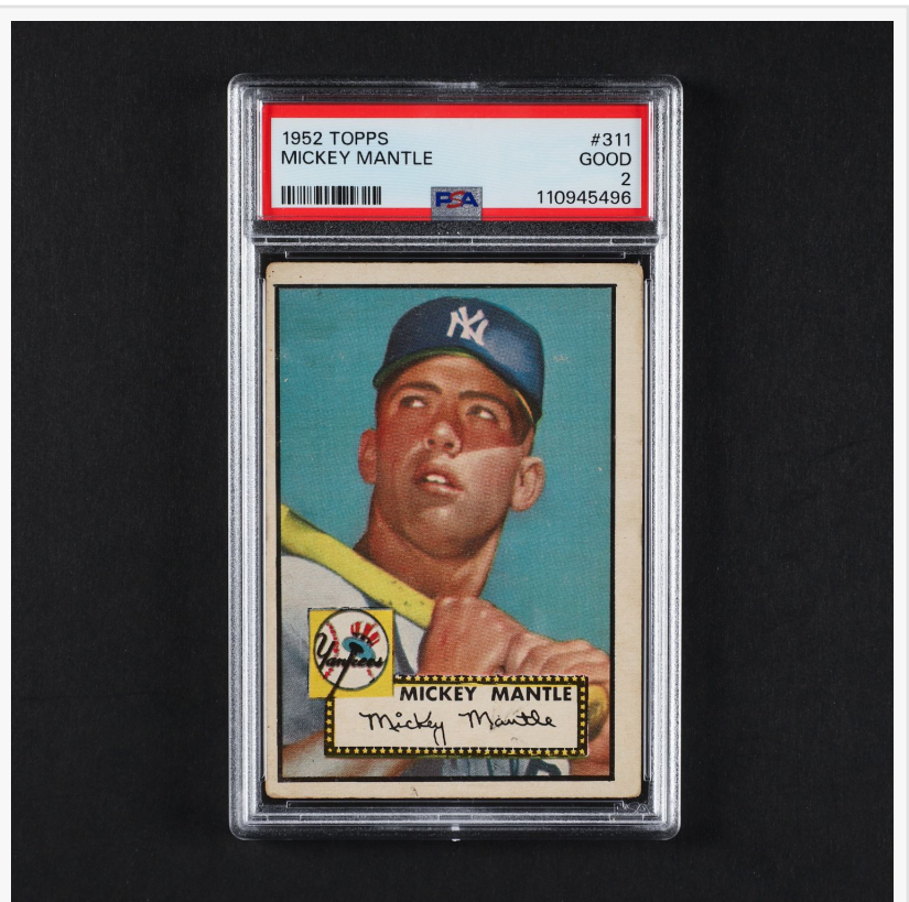
1952 Topps #311 Mickey Mantle "holy grail" baseball card, graded 2 Good from PSA for its excellent surface and strong edges, a must-have for serious sports card collectors. (CA$59,000)

Bidders were treated to two 1952 Mantle cards in the auction. The example that brought $59,000 wasn't perfect. It was graded 2 Good from PSA, with imperfect corners and an off-center image area. But it also boasted an excellent surface and strong edges. Ultimately, bidders saw the card for what it was: a rare '52 Mantle card in a category of its own and a true "holy grail" collectible.