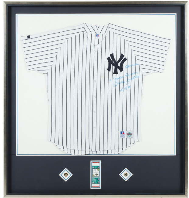
New York Yankees jersey, signed and inscribed by Mickey Mantle in 1993 and presented to the Toronto Blue Jays in appreciation for the team inviting him to the World Series. (CAS$5,015)

This press release can be viewed online at: https://www.einpresswire.com/article/825851366