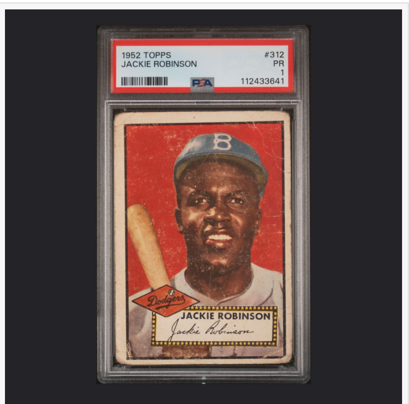
1952 Topps #312 Jackie Robinson baseball card, graded PSA 1 PR, from Topps' fabled 1952 6th series, #311 Mickey Mantle to #407, considered the rarest series of the 407-card set. (CA$5,900)

Miller & Miller Auctions, Ltd. is Canada's trusted seller of high-value collections and is always accepting quality consignments. The firm specializes in watches and jewelry, art, antiques and high-value collectibles. Its mission is to provide collectors with a trusted place to buy and sell.