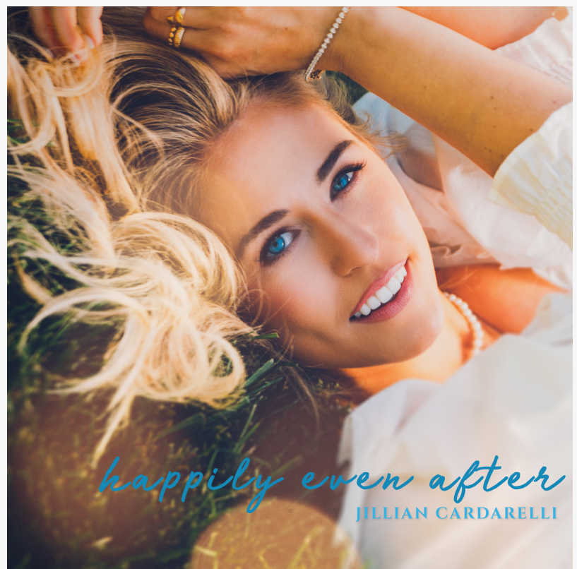
"Happily Even After" Cover Artwork

For updates, tour dates, and more information, visit www.JillianCardarelli.com .