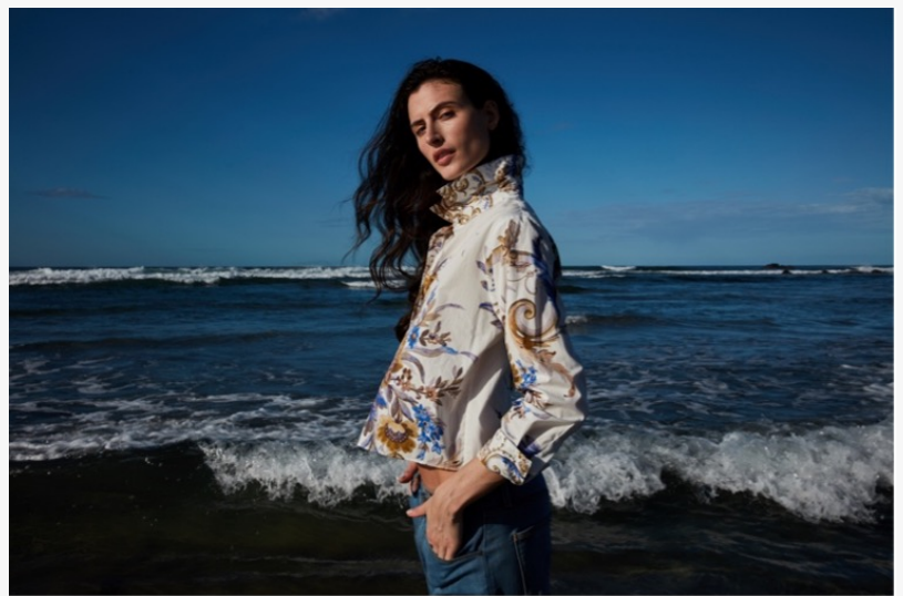
Summer 2025 Collection