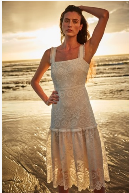
Summer 2025 Collection

SAMUEL WAXMAN CANCER RESEARCH FOUNDATION