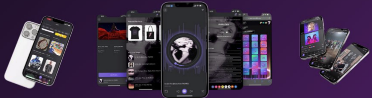
FENIX360-The Artist-First Platform

Fuel your passion, share your sound. FENIX360 empowers musicians to connect, collaborate, and thrive. Let your music ignite the world.