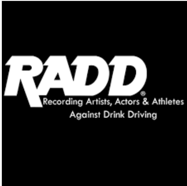
RADD-Recording Artists Against Drunk Driving

This press release can be viewed online at: https://www.einpresswire.com/article/825900641