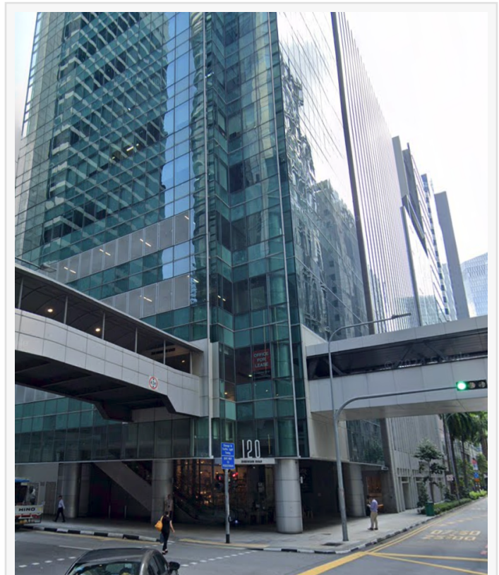
Street View of our oOffice

Solix Technologies, Inc., a leading provider of enterprise data management and AI-driven solutions, today announced the opening of its new office in Singapore . This strategic expansion strengthens Solix's presence in the Asia-Pacific (APAC) region, providing local support, enhanced customer engagement, and expanded partnerships to meet the growing demand for data archiving, compliance, analytics, and AI-driven enterprise transformation.