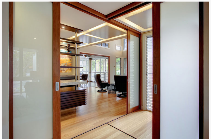
Frosted glass sliding doors define a multipurpose room that can function as a study, second lounge, or guest bedroom—adaptable for different life stages.