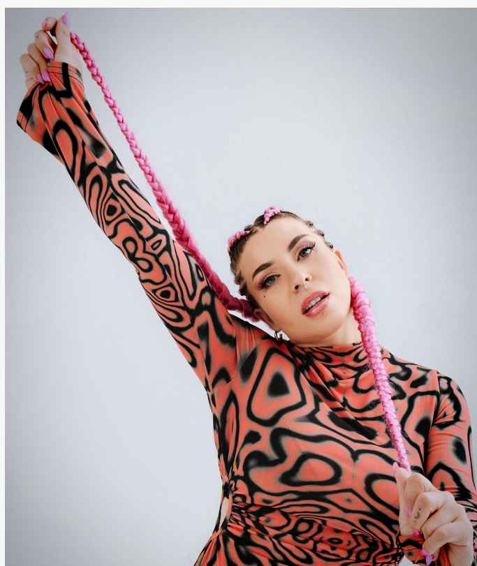
LaRudche Drops Empowering Funk-R&B Anthem "Mind My Own Business"

This press release can be viewed online at: https://www.einpresswire.com/article/826141554