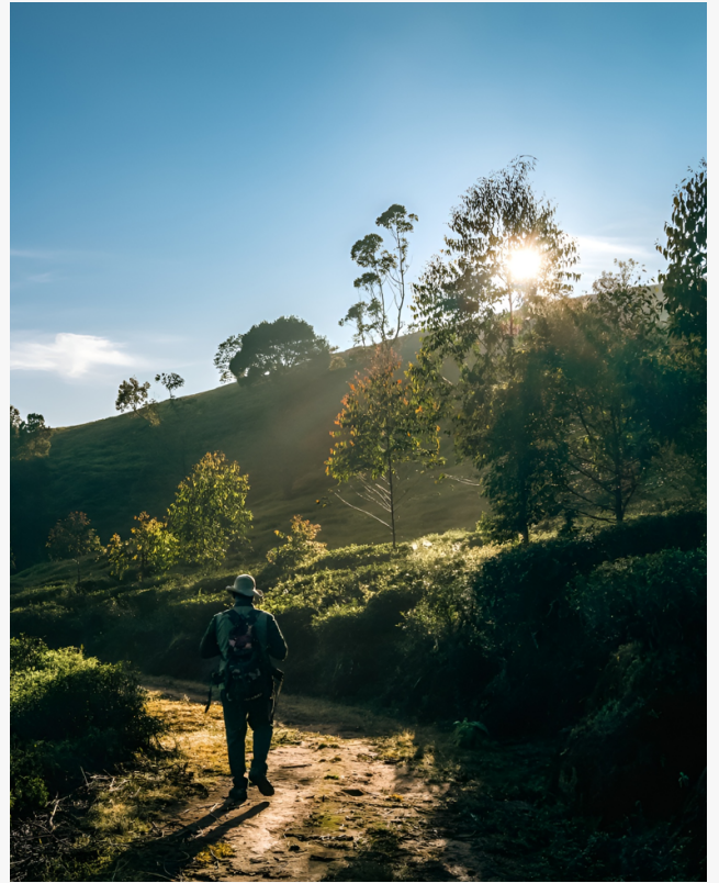
Pekoe Trail Image at Heritance Tea Factory Sri Lanka

Heritance Hotels and Resorts is the flagship brand of Aitken Spence Hotels, a part of Aitken Spence PLC, a leading Sri Lankan blue-chip conglomerate. Aitken Spence Hotels oversees a diverse collection of 18 hotels and resorts across Sri Lanka, India, Oman, and the Maldives through its diverse collection of brands Heritance Hotels and Resorts, Adaaran Hotels & Resorts, and Turyaa. Heritance Hotels & Resorts stands as the custodian of the largest portfolio of Bawa designed hotels in Sri Lanka, adding a touch of architectural distinction to its rich offerings.