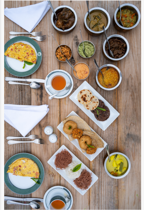
Pekoe Trail Picnic Breakfast Spread Image at Heritance Tea Factory Sri Lanka