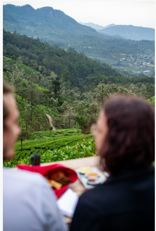
Pekoe Trail Picnic Breakfast Image at Heritance Tea Factory Sri Lanka