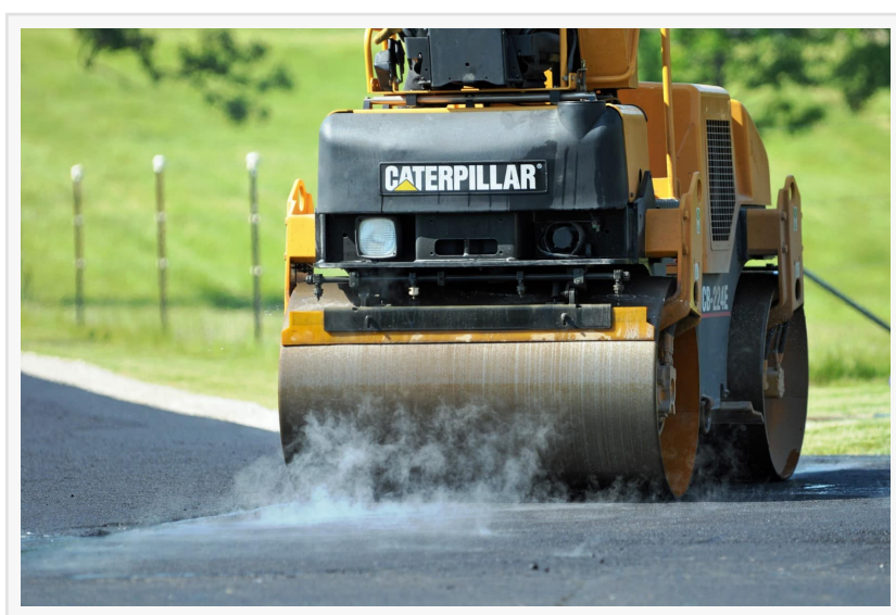
Asphalt Driveway Paving in Toms River, NJ

This move comes as Toms River Township proceeds with a large-scale capital improvement plan, backed by $8.2 million in dedicated funding for road paving as part of a broader $14.7 million bond ordinance. The Township's emphasis on new equipment requirements for contractors bidding on public projects has prompted Asphalt Worxx to proactively invest in a newly expanded fleet, including a highperformance milling machine and