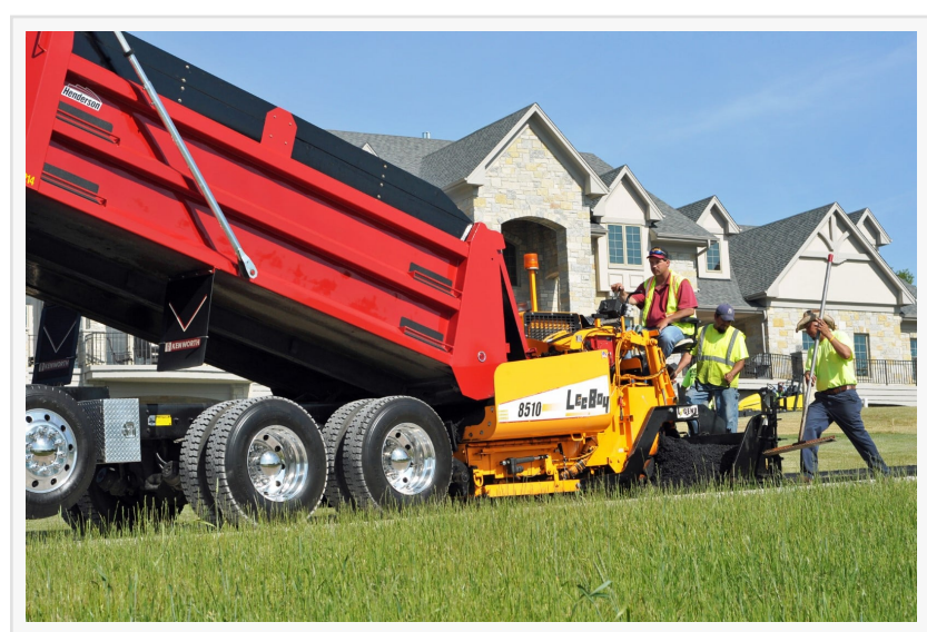
Asphalt Driveway Paving in Point Pleasant, NJ

New Jersey's infrastructure demands—driven by aging pavement, seasonal freeze-thaw conditions, and increasing vehicular wear—have placed a premium on experienced, well-equipped paving contractors. With