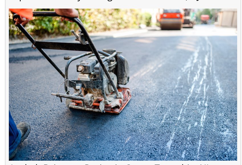
Asphalt Driveway Paving in Ocean Township, NJ