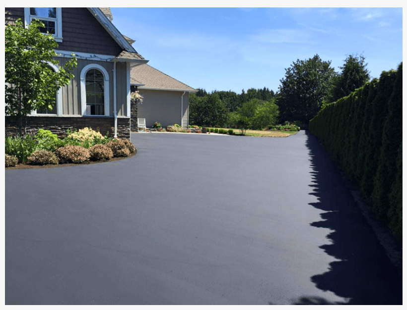
Asphalt Driveway Paving in Jackson, NJ

next-generation paver. These upgrades are purposefully aligned with current municipal specifications, giving the company the tools to compete on high-volume jobs while maintaining flexibility for residential and commercial work.