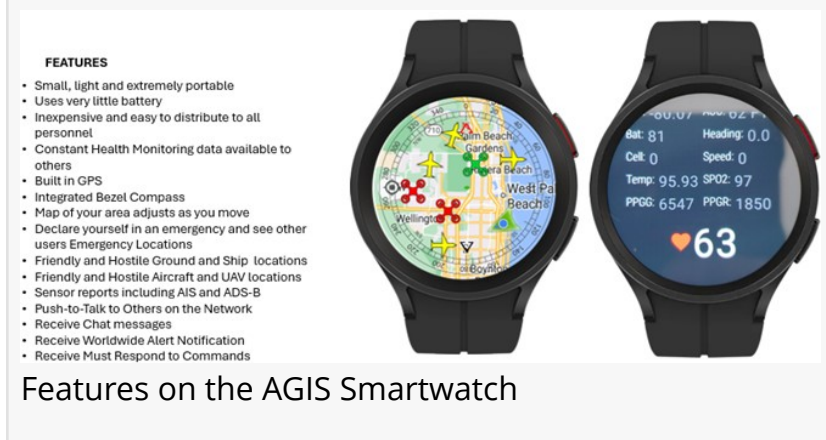
Features on the AGIS Smartwatch

The military is always looking for new ways to use technology to make soldiers more capable and effective. The military has been moving towards providing battle status information directly to individual soldiers, as seen in the development of smaller, more advanced radios and by using Link-16 with mobile systems. Our breakthrough can now bring Link-16 data directly to Samsung Biometric Smartwatches, which also reports if the wearer is injured.