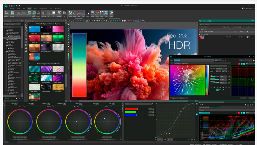
True HDR color preservation: Edit GoPro/iPhone footage without washed-out colors.

Supercharged Curve Line: Design intricate tapered lines (0%-200% thickness), add blur/feathering, choose end caps. Ctrl+Click editing directly on the scene eliminates timeline