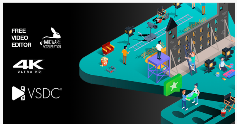
VSDC Pro 10.1: DaVinci-level HDR meets After Effects motion graphics in one affordable editor.

Why VSDC Stands Apart: The Best of DaVinci & After Effects, Unified