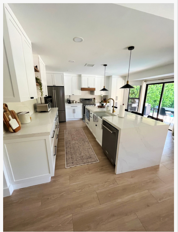
Modern Farmhouse Kitchen by Mora Interior Design

This client-first philosophy has earned Mora Interior Design a steady stream of referrals, repeat business, and consistently positive reviews. Clients frequently cite Mora’s attention to detail, clear communication, and ability to balance aesthetics with functionality as reasons they