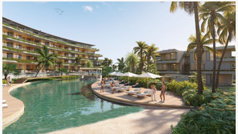
River Island Punta Cana - A residential project in the heart of Bávaro - Punta Cana made up of 540 apartments with 1, 2 and 3 bedrooms, overlooking a majestic pool that interconnects all the buildings, has a BBQ area and tropical gardens.