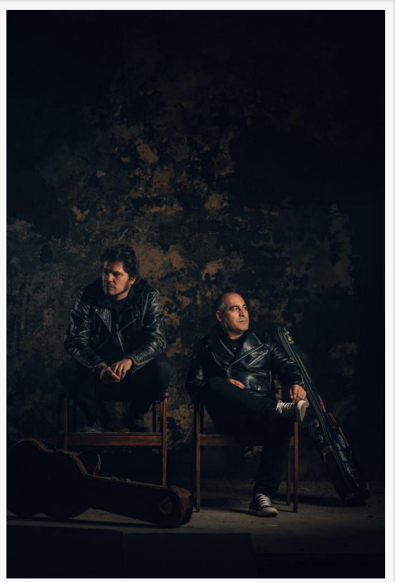
DaPunksportif brings raw energy and rock 'n' roll power from Portugal to Newark, closing out the North to Shore Festival 2025 with their electrifying U.S. debut.