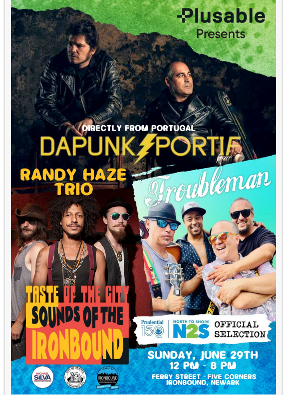
The Taste of the City. Sounds of the Ironbound Festival brings North to Shore 2025 to a vibrant close celebrating Newark with global flavors, live music, and cultural pride in the heart of the Ironbound.

Ecuadorian, and other global communities through food and sound