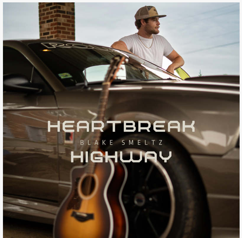
Heartbreak Highway Cover Art.

- "Nicotine Daydream," a nostalgic, high-energy anthem about first love, Springsteen, and the