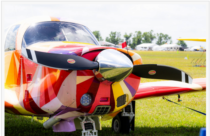
Aviation Enthusiasts Name Hartzell's Outlaw Propeller

PIQUA, OH, UNITED STATES, June 30, 2025 /EINPresswire.com/ -- A new era of performance and style has arrived for Mooney aircraft owners with the FAA's approval of Hartzell Propeller's latest STC'd propeller system for the Mooney M20 series. Hartzell Propeller, a Signia Aerospace Company, is a global leader in advanced propeller design and manufacturing.