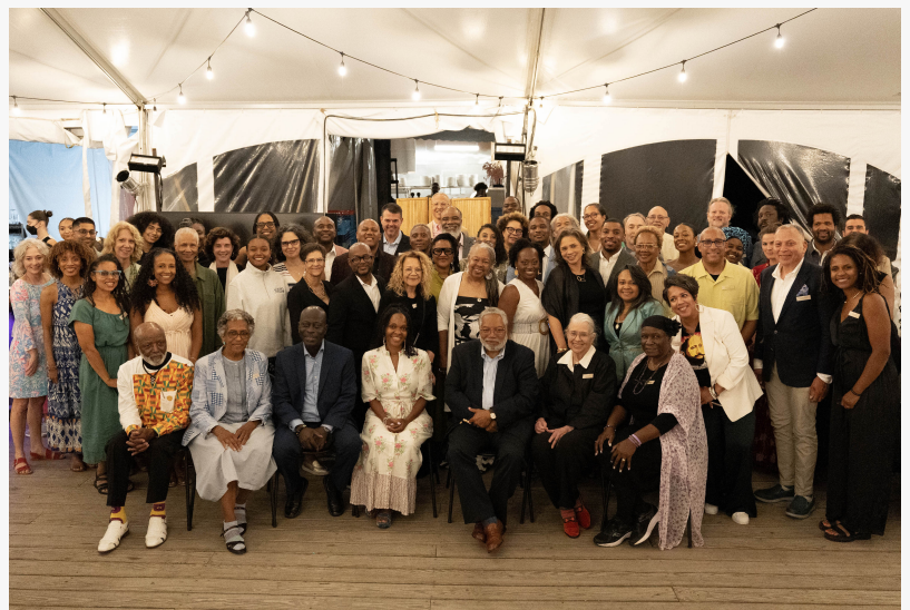
Fellows and guests gathered at the 2024 Du Bois Forum

workshops in partnership with institutions such as the Boston Athenaeum and Kripalu. The forum has been featured in venues such as Forbes and The Boston Globe.