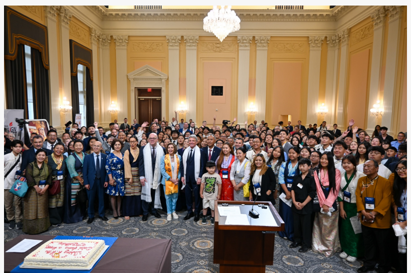
Tibet Lobby Day participants gather on Capitol Hill to celebrate His Holiness the Dalai Lama’s 90th birthday.

“I’ve been inspired by the Dalai Lama for a long time, as a human being I’ve been inspired by his personal commitment to practicing patience and charity,” Congressman Jim McGovern said. “As a person raised in the Catholic faith, I’ve been inspired by his role as a spiritual leader, and as a Congressman, I’ve been inspired by his role as a national leader, guiding his people through dark times toward a brighter future. His Holiness inspires millions, his teachings on religious tolerance, non-violence, and peace building, and his advocacy for the freedom and dignity of the Tibetan people. Next year, let us celebrate his birthday with him in Lhasa, Tibet.”