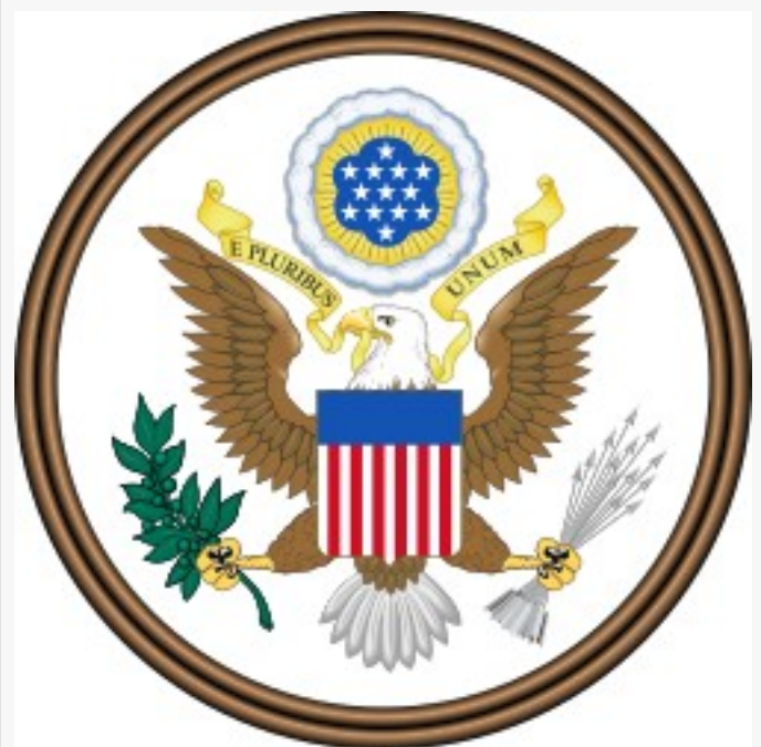
The E Pluribus Unum motto

The easy-to-understand guide to seven-figure gifts.