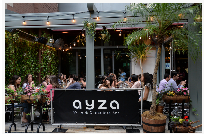
Charming garden patio at Ayza featuring floweradorned surroundings and a quaint molly trolley, perfect for leisurely meals.

A Brunch Scene with Character While AYZA first built its reputation on evening dining, the weekend brunch has become a standout experience in its own right. Guests flock to the sunlit garden patio, adorned with flowers, to savor offerings like the Garden Melt Omelette, Fig Berries Burrata Toast, and Citrus Chicken Tacos, all paired perfectly with refreshing mimosas. "It's one of those rare places where brunch still feels like a treat," says longtime guest Amanda Kelock. "Not