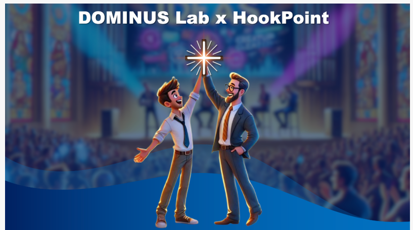
1 Million Views for a Mission: DOMINUS Lab and HookPoint Unite to Power Christian Innovation

CALIFORNIA, CA, UNITED STATES, July 3, 2025 /EINPresswire.com/ -- DOMINUS Lab, the global Christian startup movement, has officially partnered with HookPoint, a world-renowned digital agency, to drive massive online awareness for its mission to empower purpose-driven Christian entrepreneurs in the age of AI.