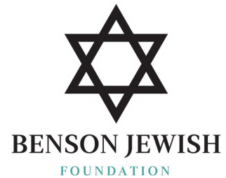
BENSON JEWISH FOUNDATION LOGO

This press release can be viewed online at: https://www.einpresswire.com/article/826878425