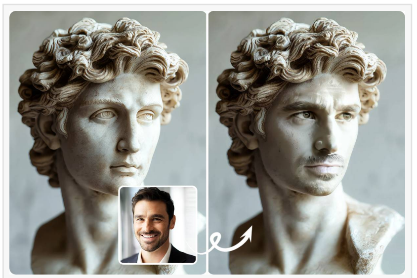
ImgGood AI: Unleashing Authentic Creativity with Effortless Image Editing

Quand Limited's AI technology in ImgGood delivers professional-quality results without requiring technical expertise. The platform's