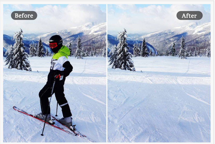
ImgGood AI: Unleashing Authentic Creativity with Effortless Image Editing

ImgGood's Al-powered features simplify complex editing tasks, delivering results comparable to professional work in seconds. The Background Remover detects and eliminates distracting backgrounds, producing clean cutouts suitable for product photos or creative projects. The Image Enhancer improves clarity, sharpness, brightness, and details, refining images for a professional appearance. For those needing a larger canvas, the Image Extender expands image borders naturally, useful for adjusting compositions or creating broader visuals without distortion. The Remove Unwanted Objects tool identifies and eliminates distractions with one click, keeping images focused.