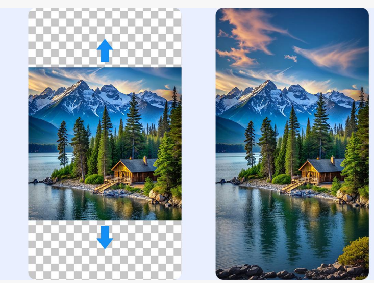
ImgGood AI: Unleashing Authentic Creativity with Effortless Image Editing

Face Swap applies AI to exchange faces in photos, creating smooth results for creative or playful projects. The Hairstyle Changer applies different hairstyles to portraits with accurate alignment, offering natural-looking transformations for experimentation. These tools, developed by Quand Limited, simplify the editing process to produce clear, effective images.