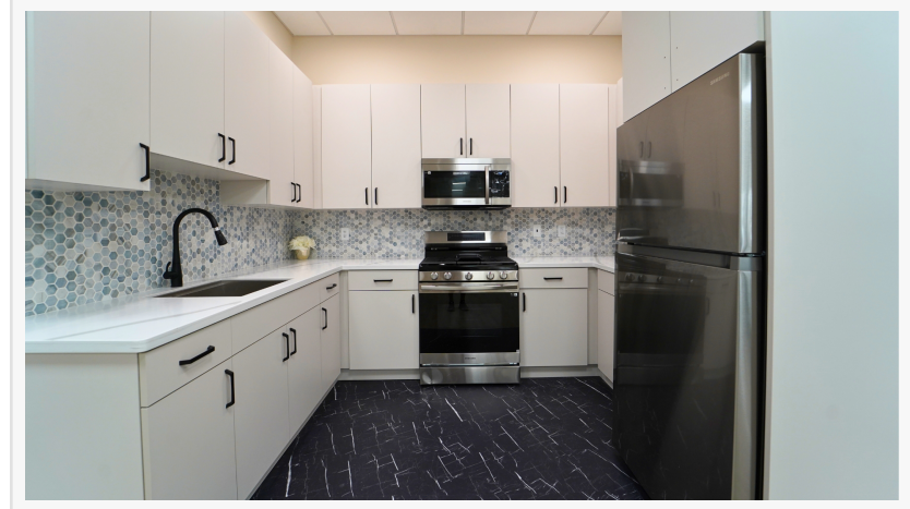
Remodeled Occupational Therapy Kitchen at Regency, a Villa Center