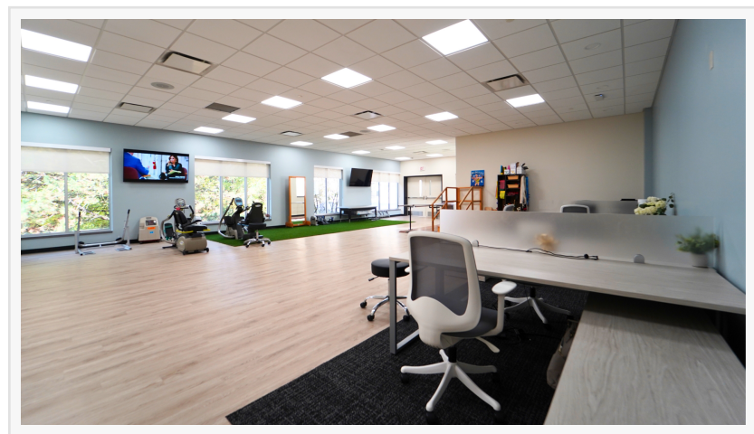
Remodeled Therapy Gym at Regency, a Villa Center