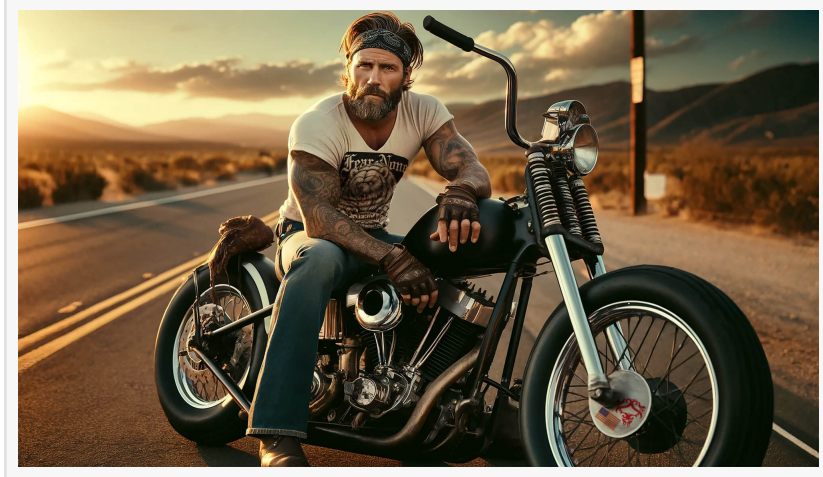
FEAR-NONE biker poster