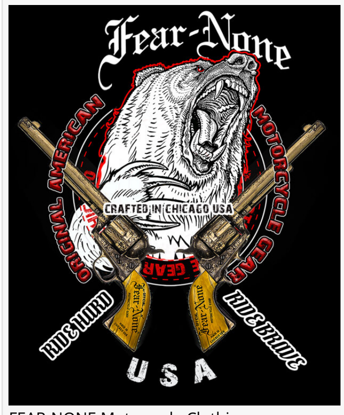
FEAR-NONE Motorcycle Clothing