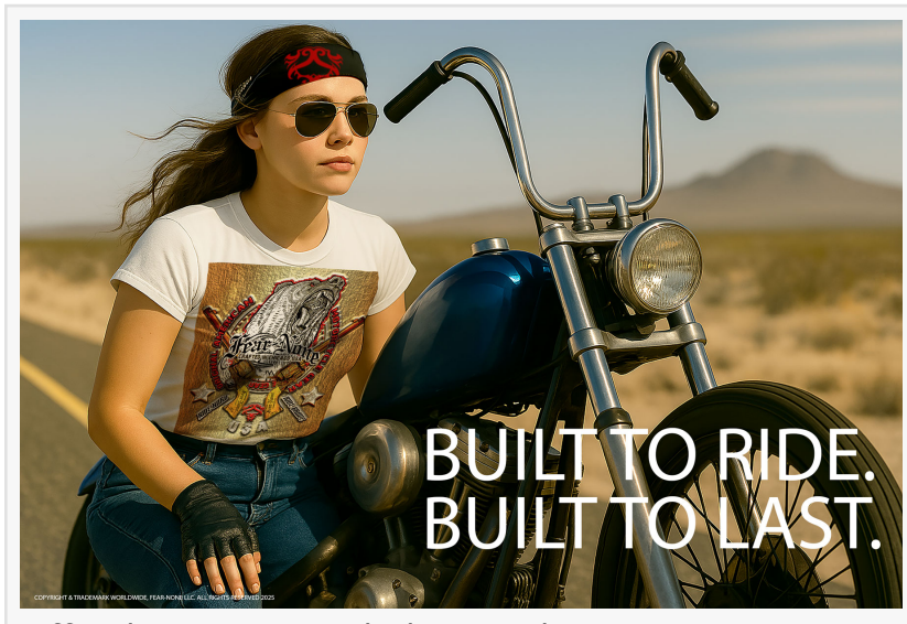
Official FEAR-NONE clothing and gear

CHICAGO, IL, UNITED STATES, July 1, 2025 /EINPresswire.com/ -- Legendary and unapologetically American, FEAR-NONE Motorcycle Gear USA delights old and young American bikers with its hardcore Summer 2025 Riding Collection, now live at <a href="https://www.fear-none.com">www.fear-none.com</a>.