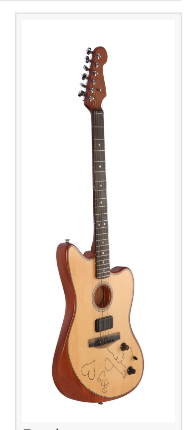
Fender Acoustasonic Jazzmaster guitar, once owned and autographed by Noel Gallagher

Hip-hop fans will have the chance to bid on a Tupac Shakur autograph estimated between $5,320 - $10,640. Meanwhile, Pink Floyd enthusiasts can bid on a framed, limited-edition print of The Dark Side of the Moon album artwork, signed by the original artist, Storm Thorgerson, also estimated between $5,320 - $10,640.