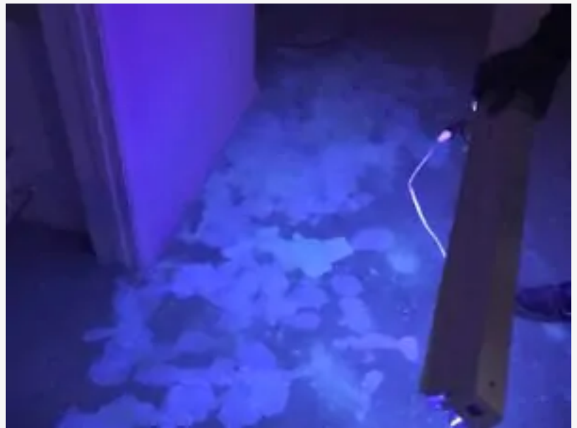
rodent urine odor removal

New Techniques Go Beyond Surface Cleaning to Deliver Long-Term Results