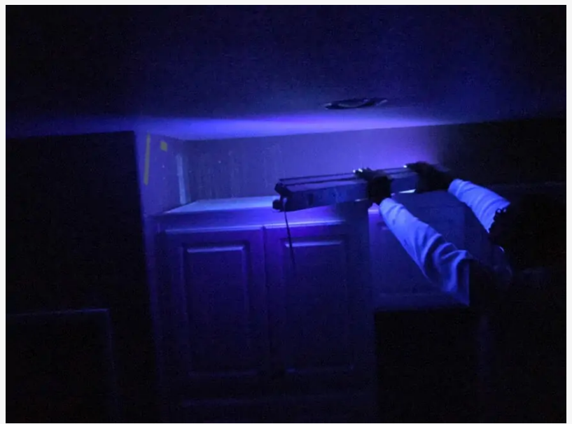
cat odor removal service

The implications for the real estate sector are significant. Odor-related concerns frequently delay sales, reduce property value, or lead to lease terminations. Prospective buyers or renters often react strongly to unpleasant smells, even if the property has been renovated or cosmetically improved. Comprehensive home odor removal services help property owners avoid costly replacements or full flooring removal, particularly when odor is confined to localized areas.