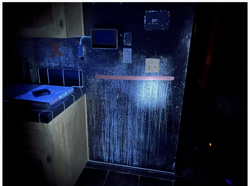
house odor removal service--

Supporting Property Sales, Rentals, and Occupancy Preparation