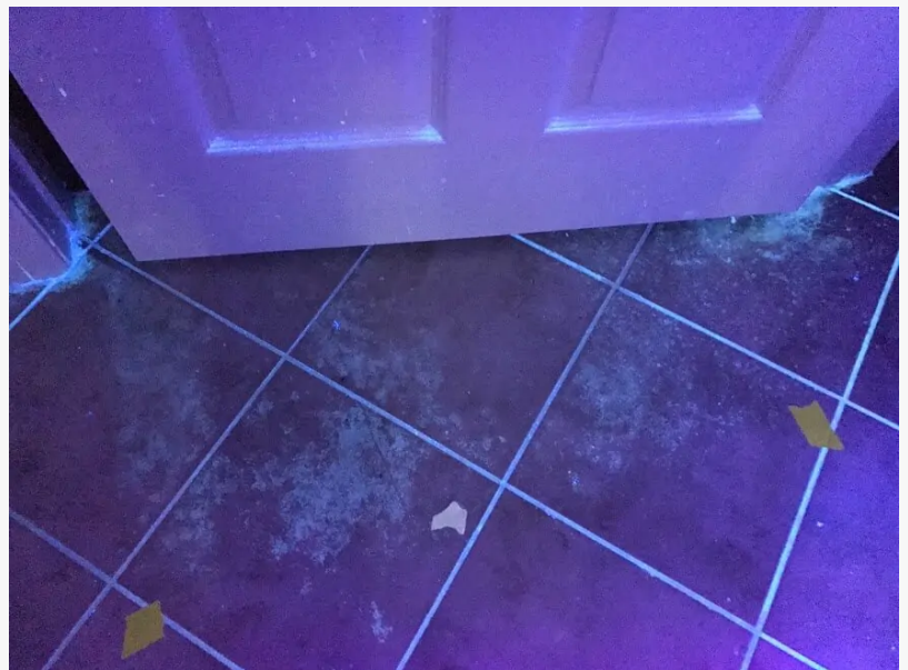
forensic pet odor inspection