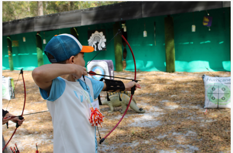
A camper takes aim during archery

MIAMI, FL, UNITED STATES, July 1, 2025 /EINPresswire.com/ -- From July 23rd to July 27th, 2025, a groundbreaking new partnership will make possible a free, medically safe summer camp experience designed specifically for children living with cerebral palsy. Hosted at Camp Boggy Creek , this unique session is made possible through the collaboration of FindAWay4Kids , Nicklaus Children's Hospital, and Camp Boggy Creek itself.