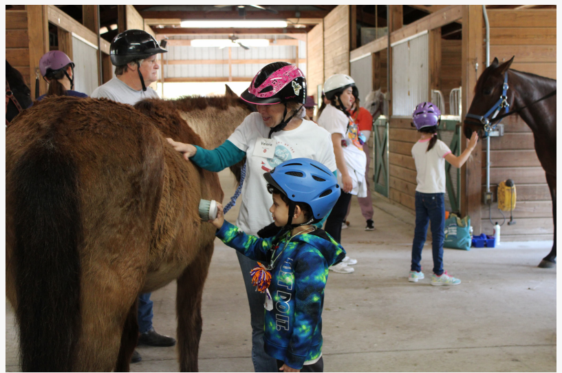
Campers experience the joy of bonding with horses