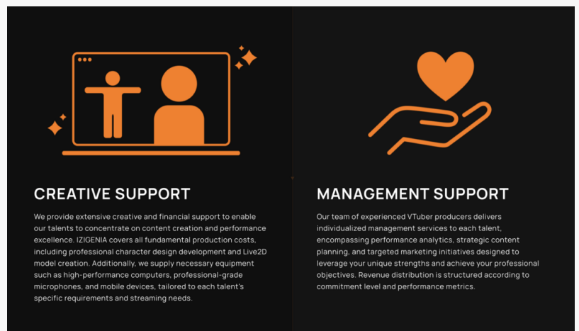
Support Izigenia Provides