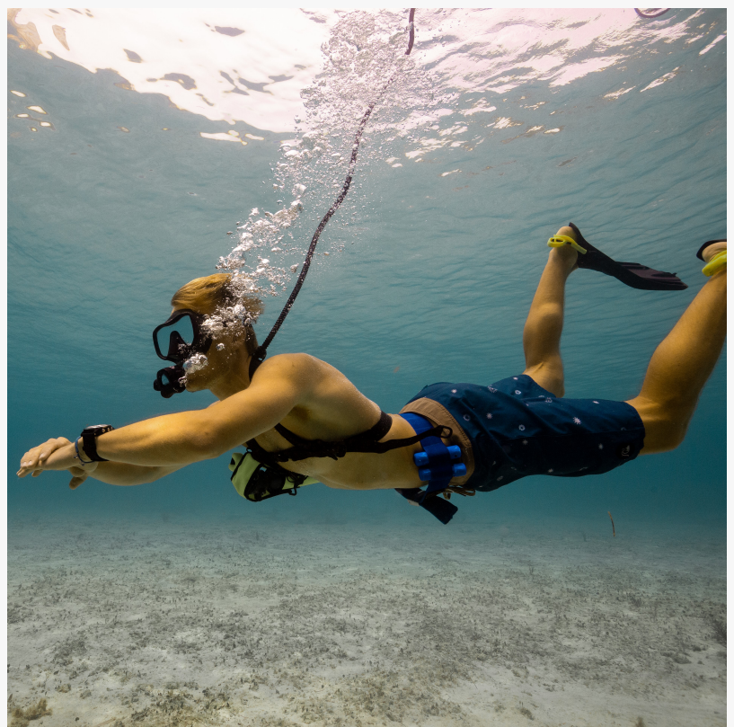
Diving Without SCUBA Tanks Is Simpler for Shallow Water