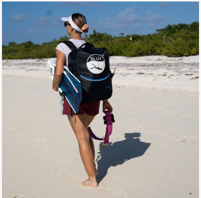
The BLU3 Nomad fits in a backpack—lightweight and portable for pool technicians who need to service jobs on the go.