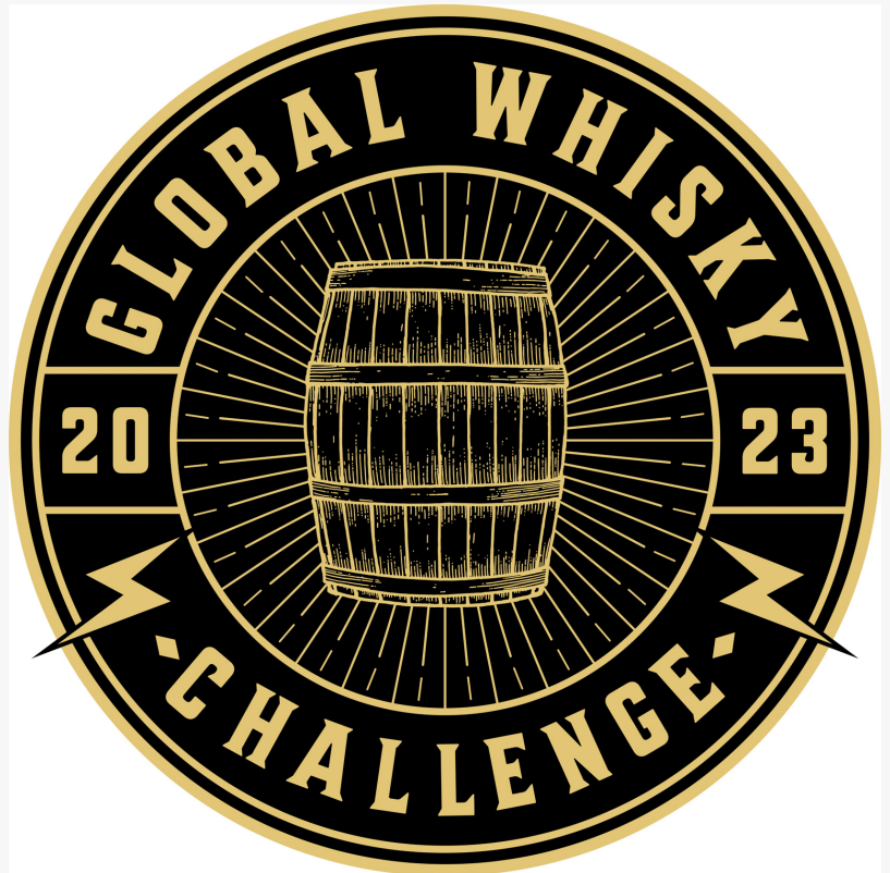
Official logo of the Global Whisky Challenge

Broomfield, Colorado-based Wine Country Network, Inc., publisher of Wine Country International and the annual World Book of Whisky and a leading producer of professional beverage competitions, presents the Global Whisky Challenge. The company currently produces nine competitions (in spirits and wine).