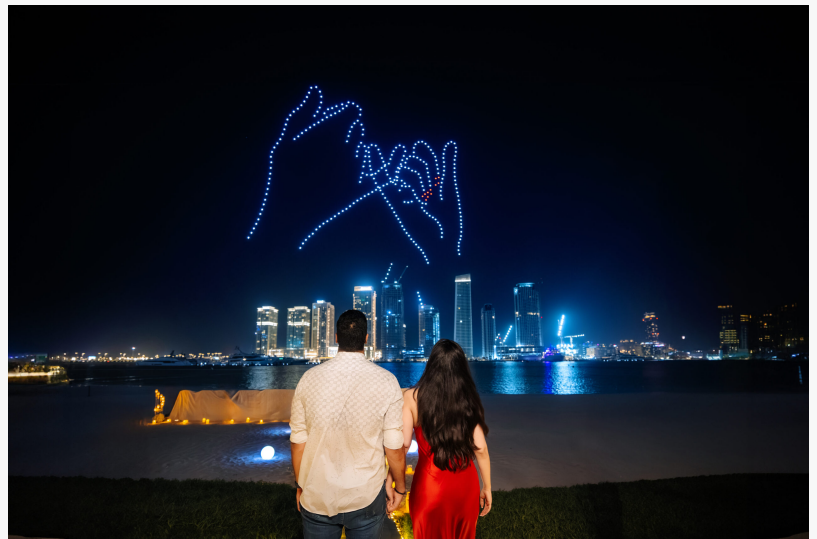
Drone Show Proposal in Dubai

DUBAI, UNITED ARAB EMIRATES, July 1, 2025 /EINPresswire.com/ -- The United Arab Emirates is fast becoming one of the world's most sought-after destinations for luxury marriage proposals, as couples increasingly seek cinematic, personalized experiences to mark the beginning of their lives together. From desert dunes to private rooftop dinners, the UAE's landscape and lifestyle are redefining what it means to 'pop the big question'.