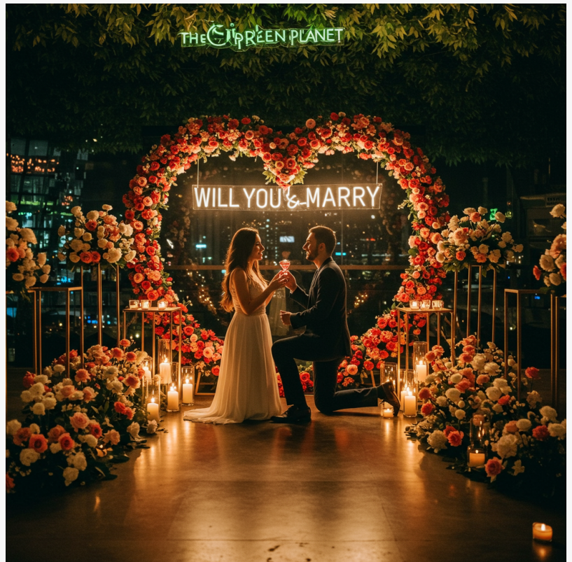
Growing interest in visually stunning proposal settings