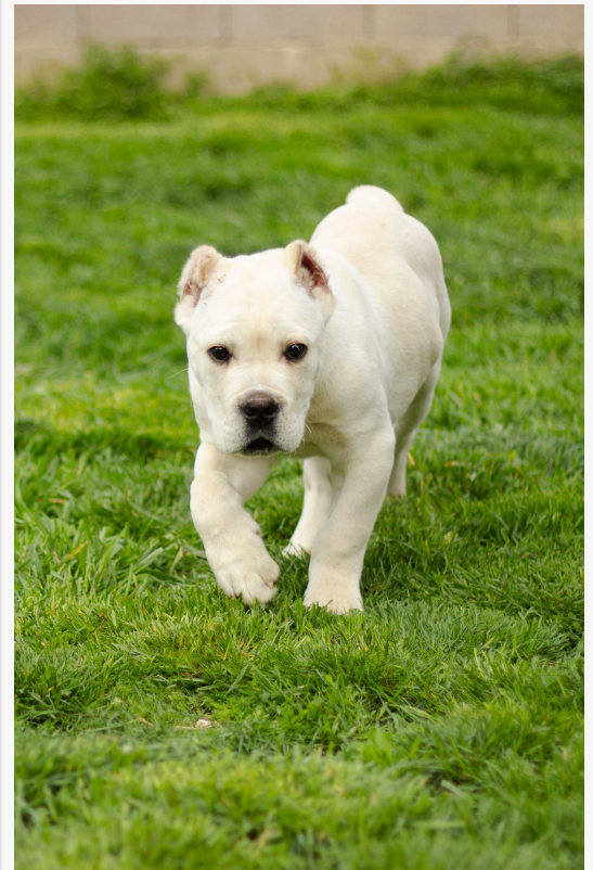
rarest color cane corso puppy is white/straw color

This unique appearance results from a mutation in the melanophilin gene, which dilutes black pigment to produce the light yellow or cream color, often accompanied by a blue nose. Unlike the fawn Cane Corso with its black mask or the isabella and gray brindle shades, the straw variant stands out with minimal black pigment, making it one of the rarest Cane Corso colors in