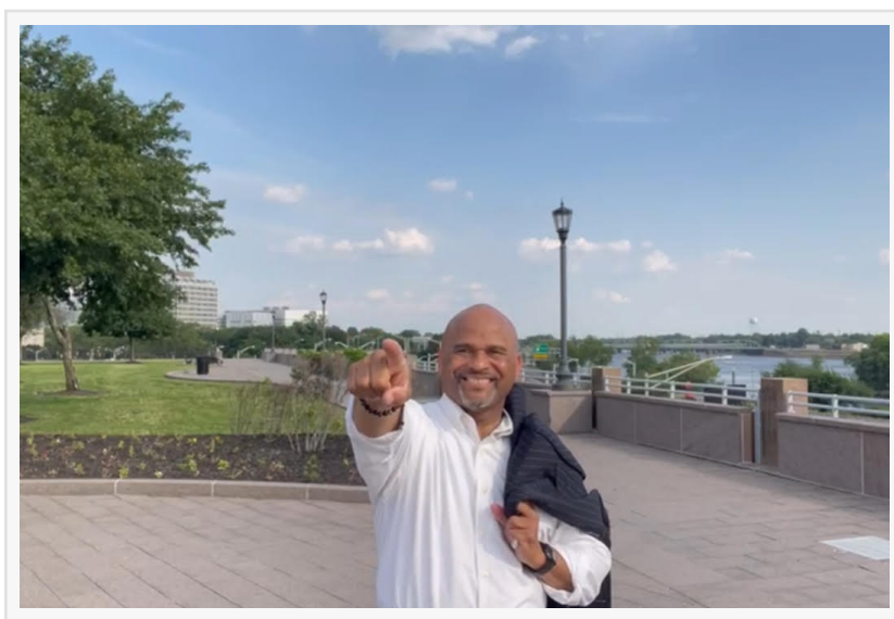
Darrell Armstrong for You

This press release can be viewed online at: https://www.einpresswire.com/article/827415435