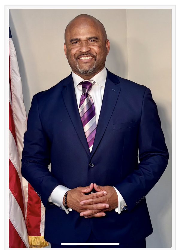
Darrell Armstrong For Governor

"Now is the time for all engaged New Jersey voters to have an option and the courage to color boldly outside of political lines," stated Rev. Armstrong. In New Jersey, as of June 2025, there are 2,423,449 unaffiliated voters compared to 2,451,752 Democrats and 1,624,437 Republicans. "I've been listening to people who strongly believe that their real-life problems have not been a priority for our government and won't be a priority for the candidates representing our two-party system," stated Armstrong.