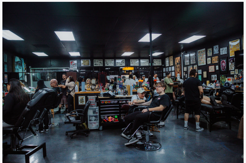
A busy day inside Golden Child Tattoo, where multiple artists work simultaneously in a vibrant, collaborative environment.