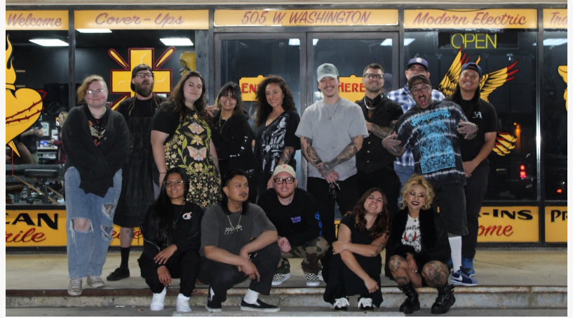
The Golden Child Tattoo team stands outside the studio's Escondido location, welcoming clients from across San Diego County.