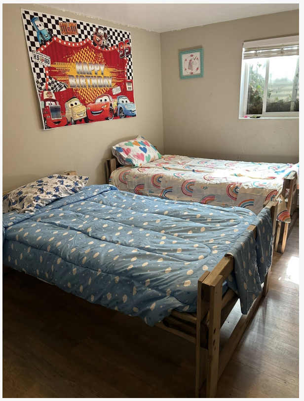
Chapter trainees deliver, assemble and put bedding on childrens' beds during the in-person delivery session at the summer chapter training, held June 20-21, 2025, in Lehi, Utah.

EIN Presswire's priority is source transparency. We do not allow opaque clients, and our editors try to be careful about weeding out false and misleading content. As a user, if you see something