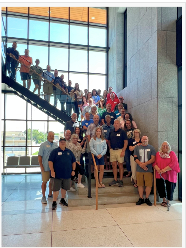
Volunteers from communities across the U.S. convened in Lehi, Utah for the Sleep in Heavenly Peace chapter leadership training, June 20-21, 2025.

With more than 150,000 kids currently waiting for beds nationwide, this expansion of new chapters is critical to reaching underserved communities and sustaining SHP's mission to end child bedlessness. The training provided chapter leadership and core team members with the skills and knowledge needed to successfully lead their local non-profit efforts.