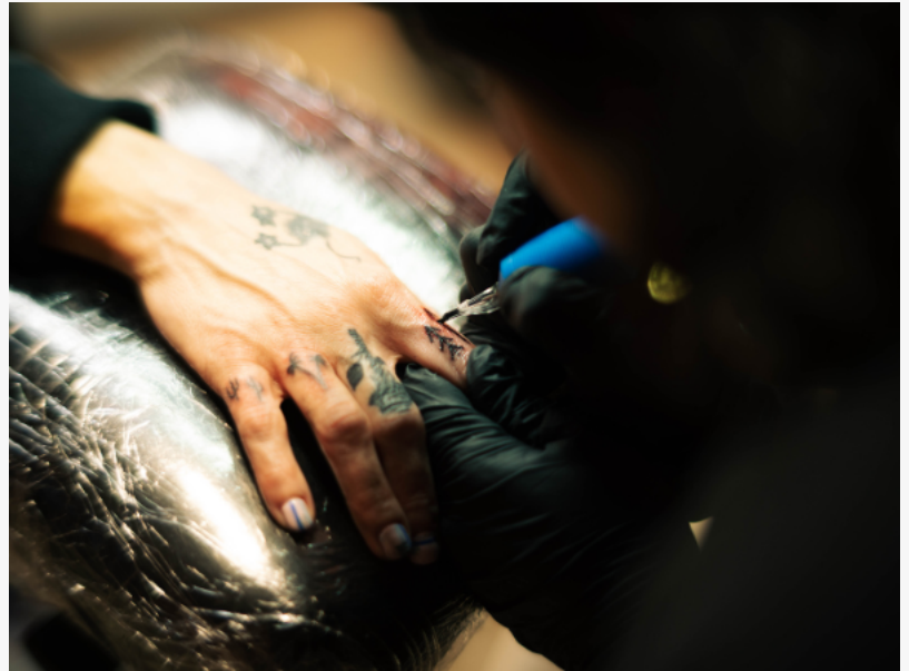
Close-up of a hand tattoo being applied using a single-needle fine line technique.

"I wanted a booking system that reflects the experience: easy, direct, and available to people around the world."