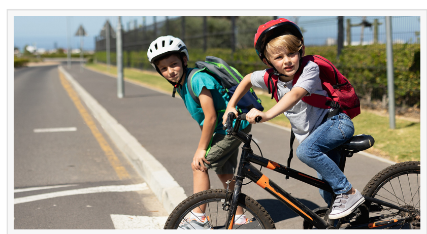
NovoaGlobal to Provide School Zone Speed Enforcement to Protect Children in Williston, Florida

WILLISTON, FL, UNITED STATES, July 2, 2025 /EINPresswire.com/ -- NovoaGlobal, Inc., a leading provider of advanced traffic safety and enforcement technology, is partnering with the City of Williston, Florida, to implement and manage a new Automated School Zone Speed Enforcement Program—a vital initiative