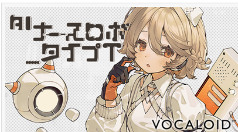
"AI NurseRobot_TypeT" Voicebank for VOCALOID6

The newly released voicebank, "AI NurseRobot_TypeT", is a VOCALOID6-exclusive voicebank that lets users enjoy singing voice synthesis using the voice of "NurseRobot_TypeT," a nurse-type