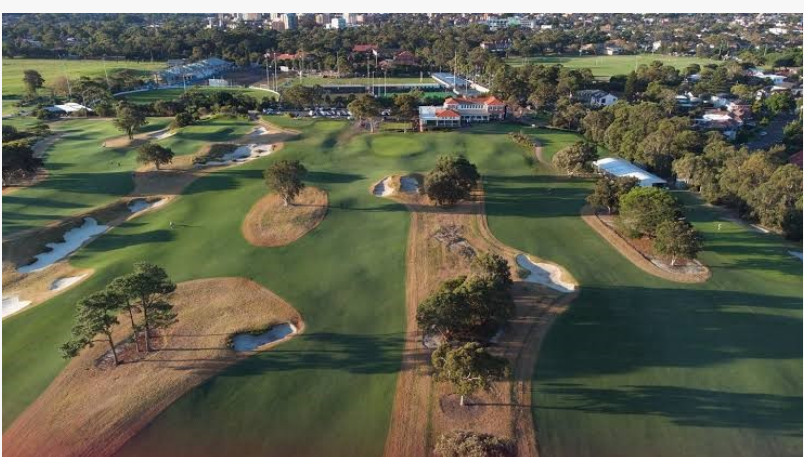
Vertmax Duo turf pigment in Sydney

Expanding Access to Advanced Turf Technology