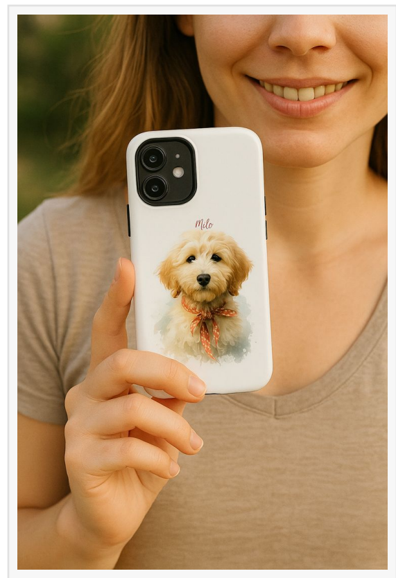
Custom Photo Phone Cases

Scaling with Substance: Behind the Scenes Operating from a U.S.-based fulfillment hub, OhCustom manages design-to-delivery in-house. This vertical integration allows tighter quality control, quicker turnaround times, and deep customization - from photo clarity to print placement and garment selection. Their supply chain supports small-batch orders alongside bulk runs (e.g. 50-piece coasters, golf towels) - catering to individual customers as well as businesses and events.