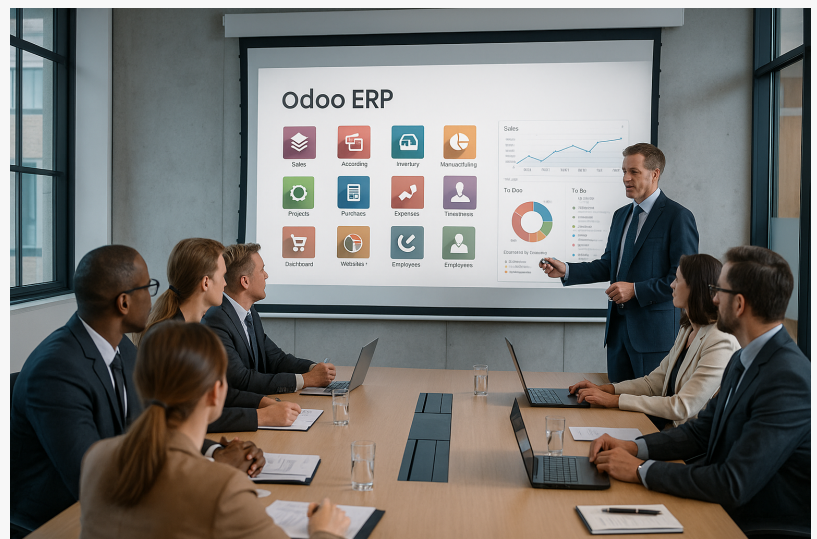
Enterprise team reviewing Odoo ERP modules during a strategy session led by SDLC CORP.

SAN FRANCISCO, CA, UNITED STATES, July 2, 2025 /EINPresswire.com/ -- In a time when operational agility is critical, SDLC CORP is helping global enterprises move beyond traditional ERP constraints through powerful, industry-specific implementations of Odoo. Known for its modular structure and open-source flexibility, Odoo is enabling businesses to transition from rigid systems to intelligent, integrated platforms—and SDLC CORP is leading that shift.