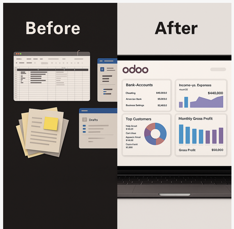
Visual comparison showing business operations before and after adopting Odoo ERP, highlighting the shift from disorganized tools to a unified system.