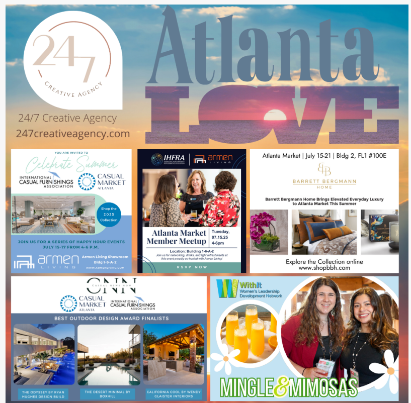
24/7 Creative Agency will host events at Summer Casual Market and Atlanta Market at AmericasMart.