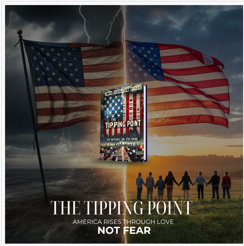
An unflinching look at how freedom unravels when fear replaces civic courage and silence replaces dissent.

This novel blends speculative fiction, spiritual insight, and political urgency. It explores a United States at the edge of collapse and a movement that rises in response, not with violence, but with a radical return to love, civic unity, and truth.