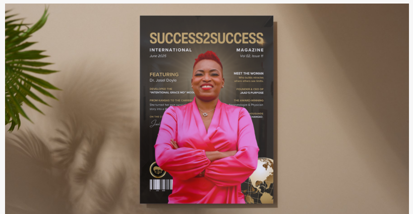
Success2Success International Magazine Issue 11

NEW YORK, NY, UNITED STATES, July 2, 2025 /EINPresswire.com/ -- The Success2Success International Magazine proudly announces the release of its 11th issue, marking a significant milestone in its journey of spotlighting individuals who lead with purpose, impact their communities, and redefine what it means to succeed.