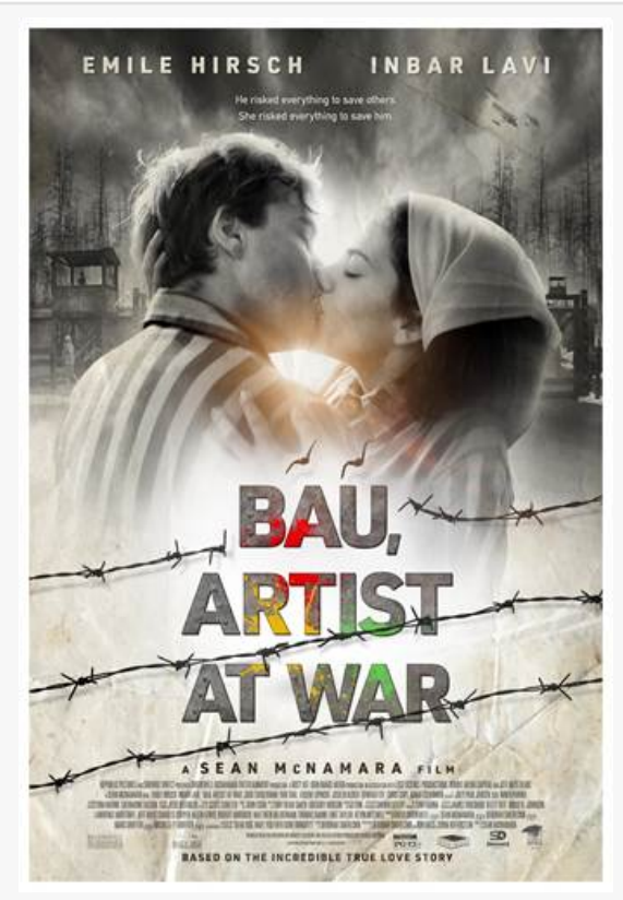
Poster Bau, Artist at War

McNamara's storytelling legacy spans 45+ feature films and over 500 episodes of television across major networks and platforms, including Netflix,