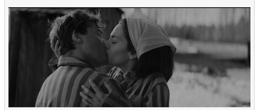
Emile Hirsch and Inbar Lavi

Official Trailer Link, Bau, Artist at War: <a href="https://youtu.be/Db89hhwUsll">https://youtu.be/Db89hhwUsll</a> For more information visit: <a href="https://youtu.be/Db89hhwUsll">www.baumovie.com</a>