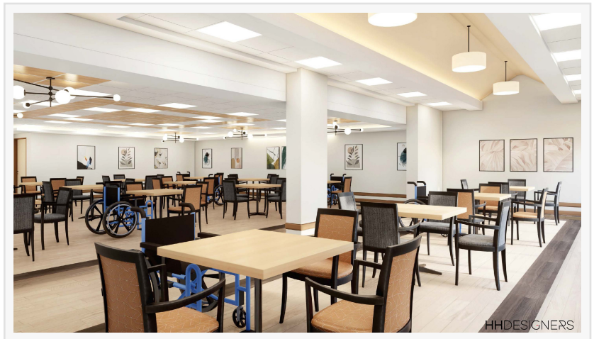
Imperial, a Villa Center Dining Room

Brandon Durkin Villa Healthcare mediarelations@villahc.com Visit us on social media: LinkedIn Facebook