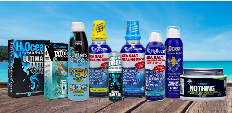
H2Ocean Product Range: The World's Leading Name in Sea Salt based Natural Products.