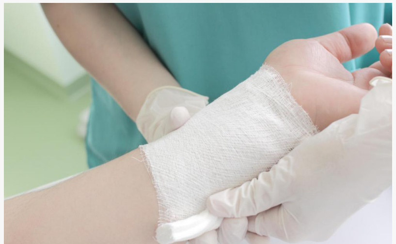
Optimum Wound Care delivers expert wound management solutions, combining advanced therapies and personalized treatment plans to accelerate healing and restore quality of life.