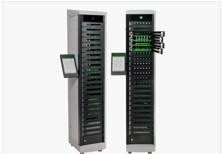
PC Locs FUYL 23 Smart Locker